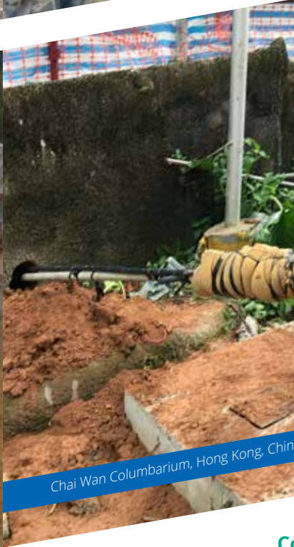
Chai Wan Columbarium, Hong Kong, China